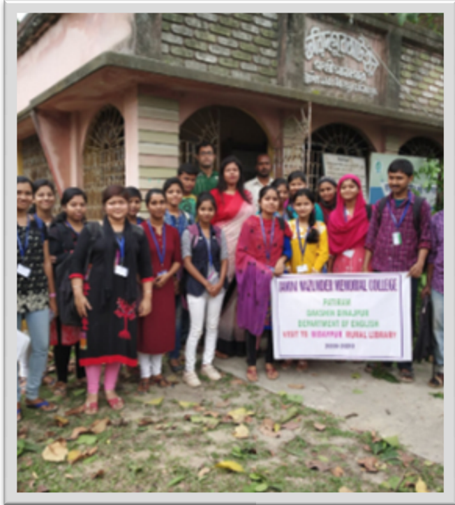
LIBRARY VISIT 02/07/2019