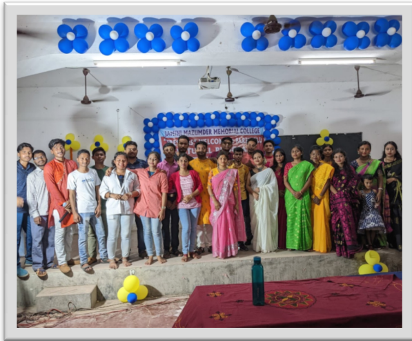
FRESHER AND FAREELL 04/08/2021