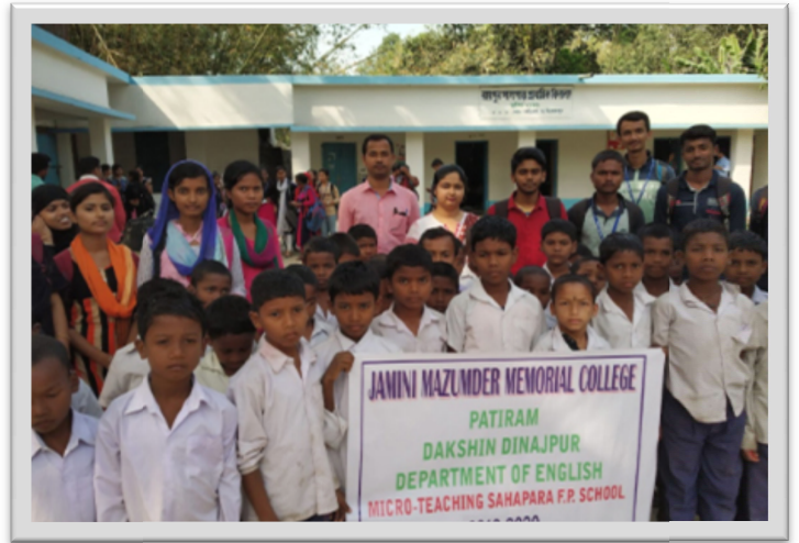
COMMUNITY OUTREACH IN MICRO TEACHING 23/12/2019 & 24/12/2019