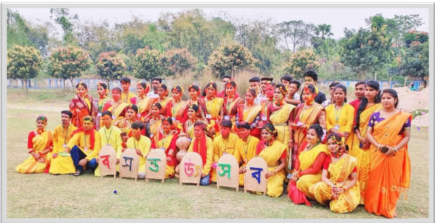
BASANTA UTSAV 2019-20