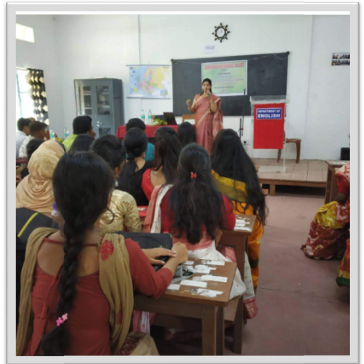
ONE DAY SEMINAR ON SOFT SKILL AND LANGUAGE TRAINING 17/01/2020