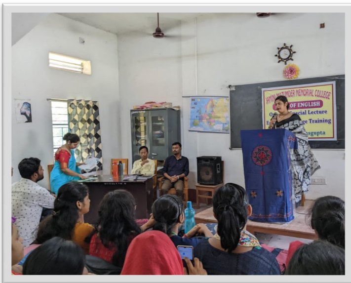
ADD-ON COURSE ON COMMUNICATION SKILL 01/07/2019 - 08/07/2019