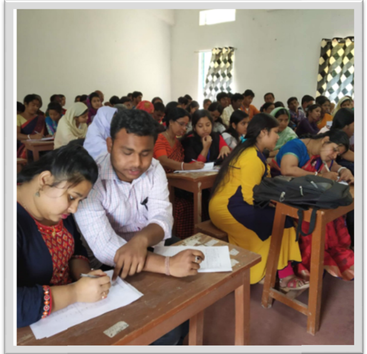
PARENT TEACHER MEETING 07/09/2019