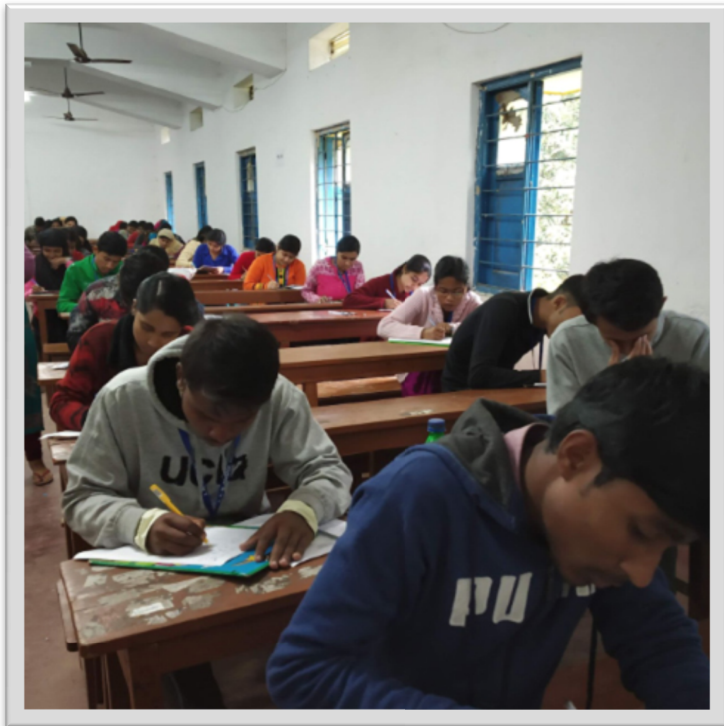
UNIT TEST 04/01/2020