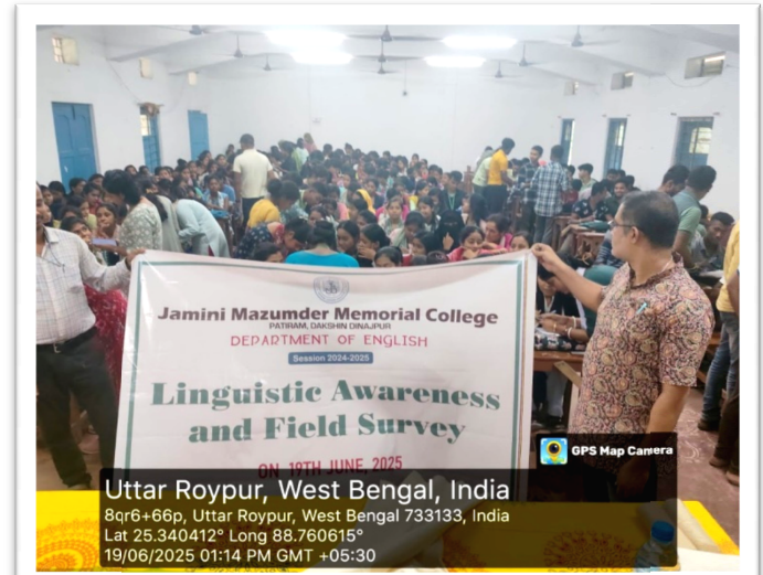
LINGUISTIC AWARENESS 19/06/2025