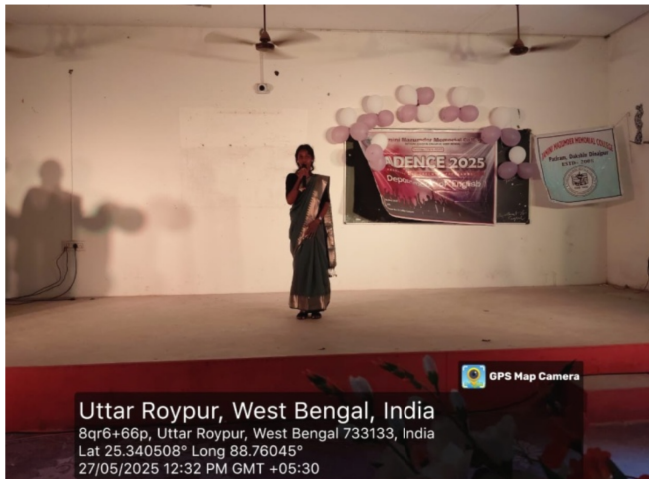
FRESHERS AND FAREWELL 27/05/2025