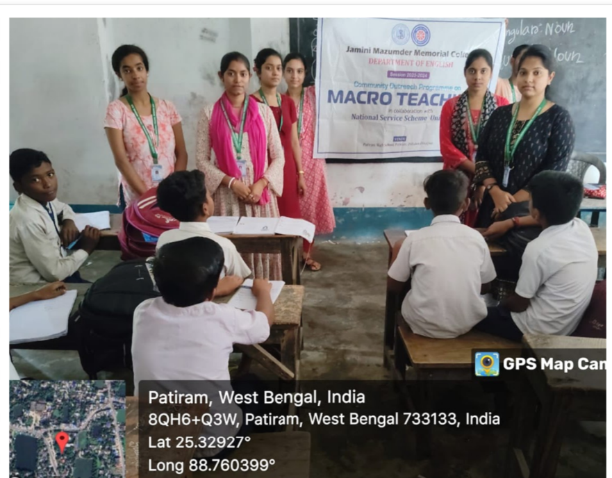
COMMUNITY OUTREACH PROGRAMME ON MACRO TEACHING 28/09/2024