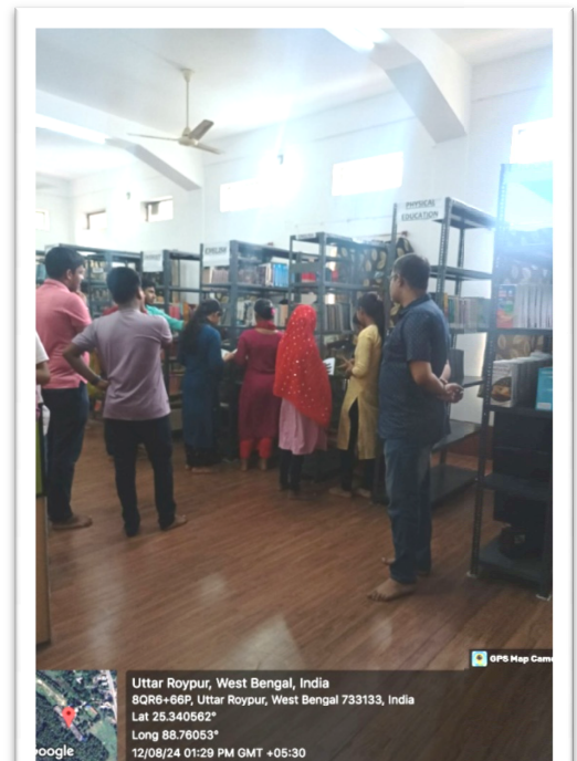
LIBRARY TOUR 12/08/2024