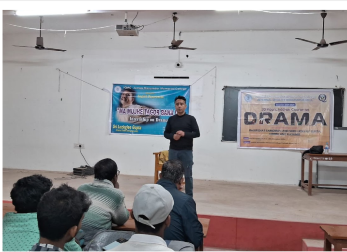
30 HRS ADD ON COURSE DRAMA 14/12/2024